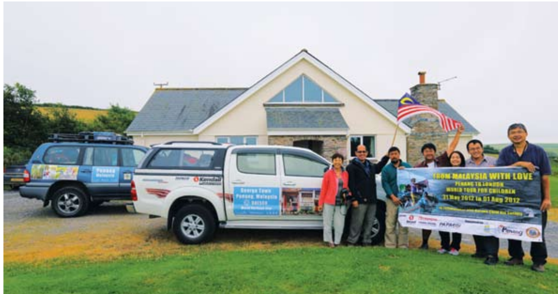
Expedition members in Dittisham.