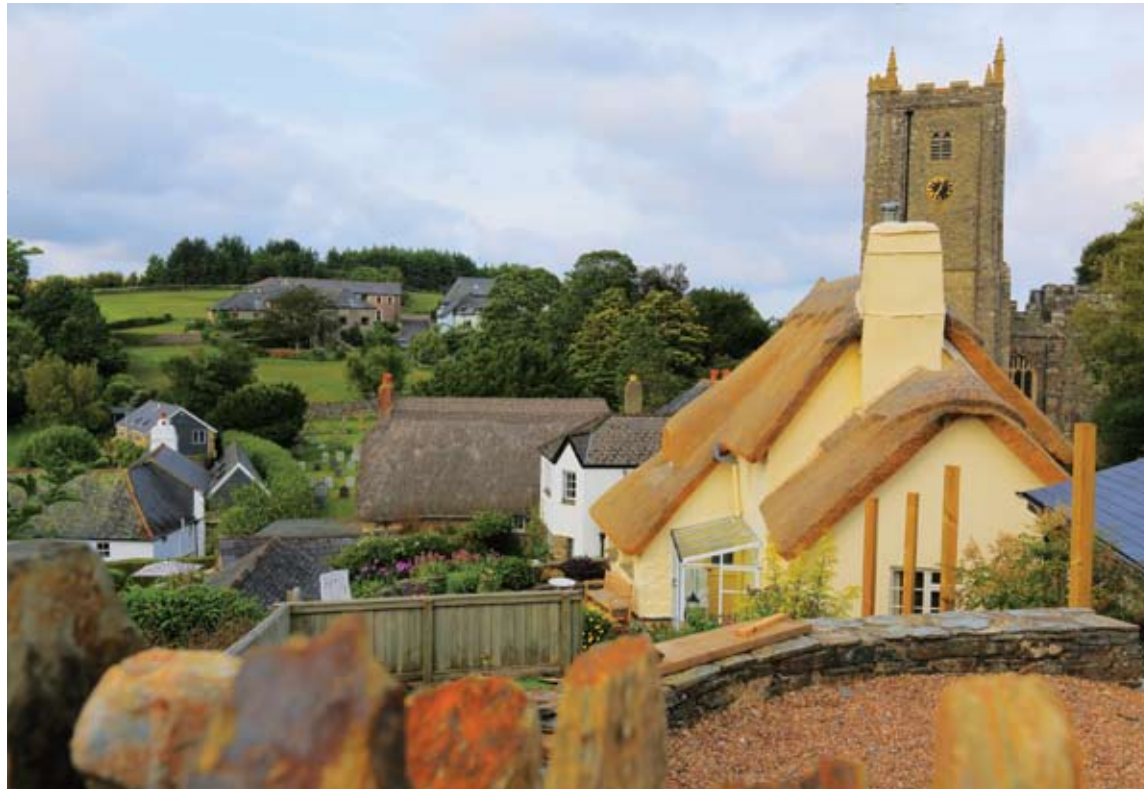
St George's Church towering above the thatched roof cottages of Dittisham.

about other cultures and especially the rich history and heritage of countries such as Kazakhstan, Kyrgyzstan and Uzbekistan was priceless.