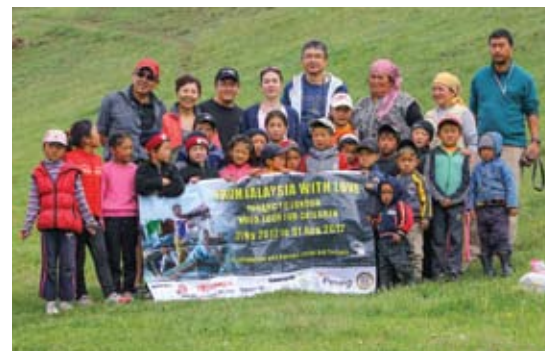
(Above and top) Interacting with the locals in Central Asia.