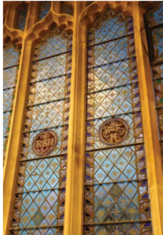
Hutchings' family crest in a window panel of St George's Church.

Traditionally, English village life revolved largely around churches and this was no exception in Dittisham where St George's