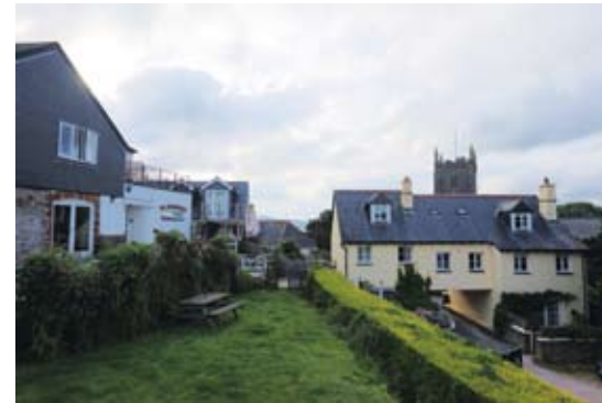
The village of Dittisham in Devon county.

Despite its long and illustrious history,